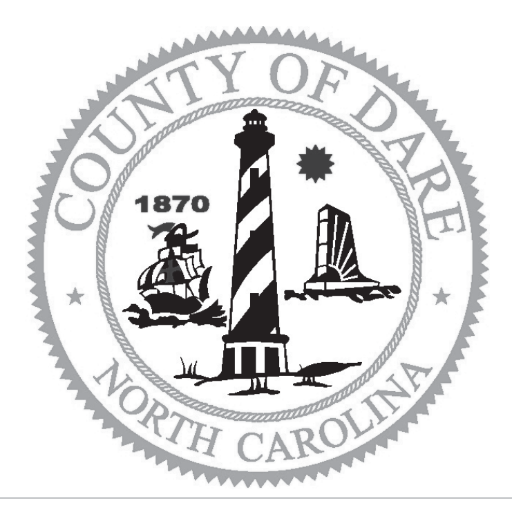
Public Hearing -- Revised TTPO and C-3 Text Amendment