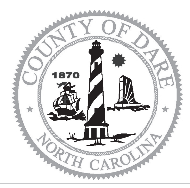
NC Office of Recovery & Resiliency Grant Award