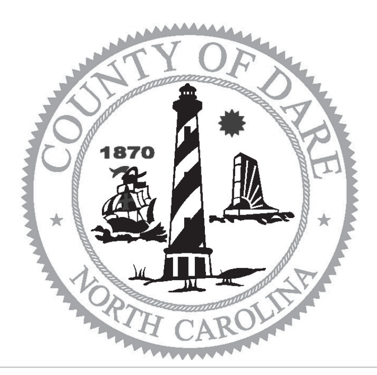
Appointment of Assessor and Tax Collector