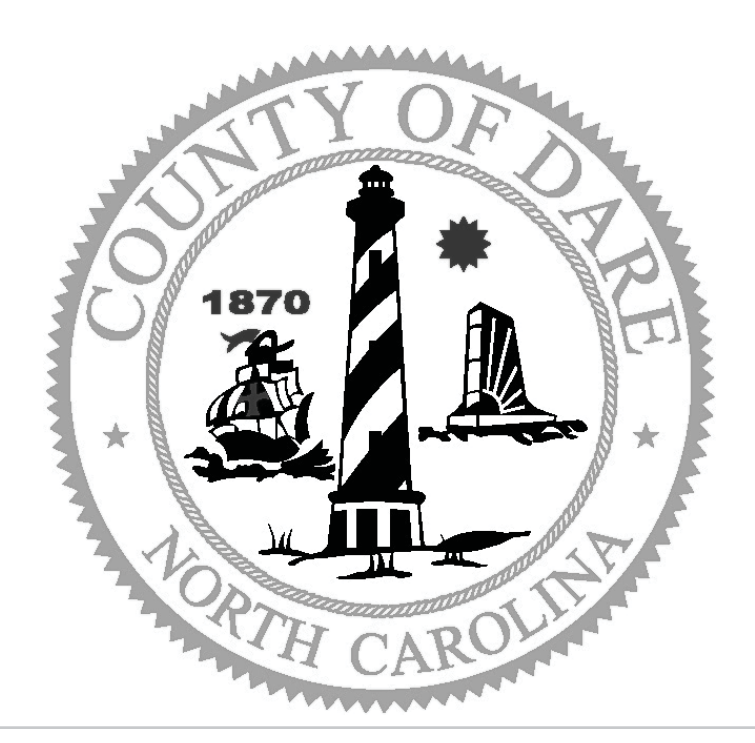
Rules of Procedure