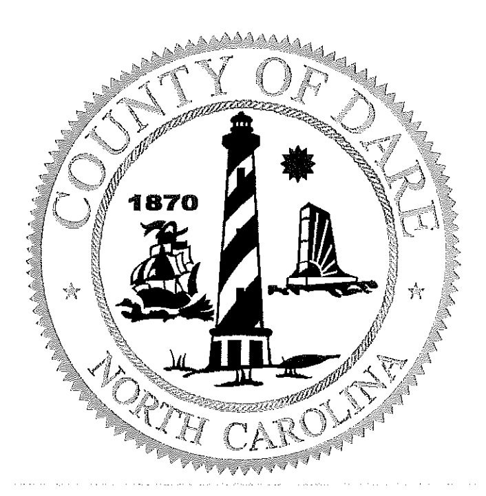
Upcoming Board Appointments