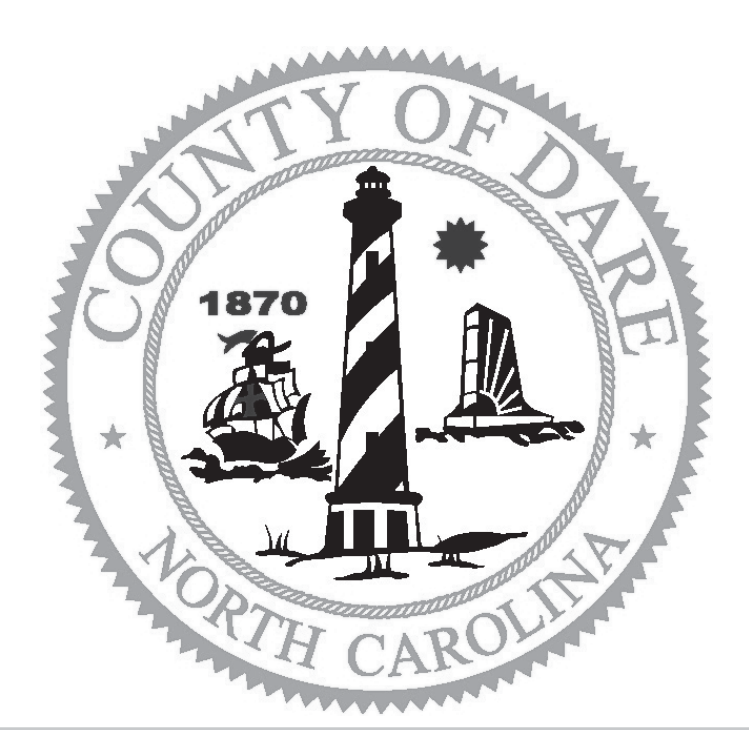
Update on the Bonner Bridge Replacement