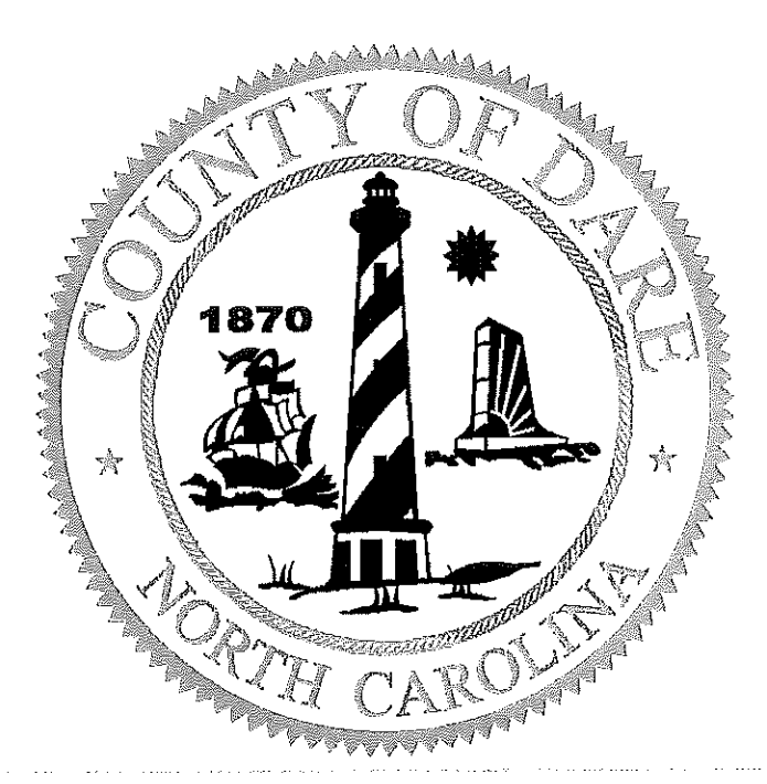
Upcoming Board Appointments