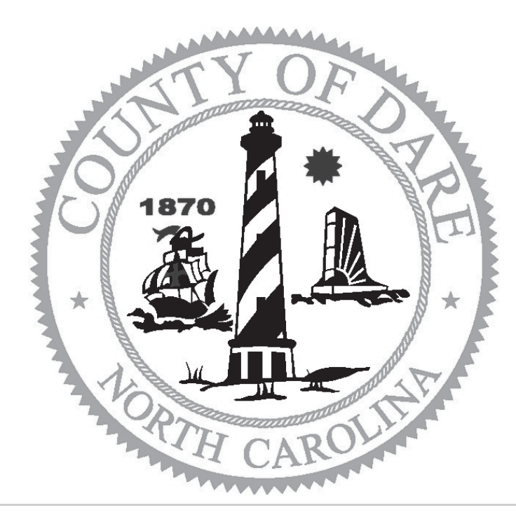
Dare County N.C. Cooperative Extension Report to the People