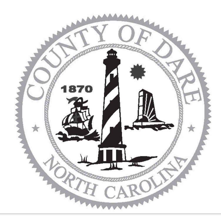
Kendrick Albaugh -- Avon Zoning Map Amendment