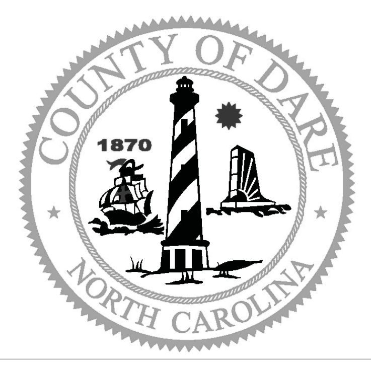
Proclamation - Alzheimer's Awareness