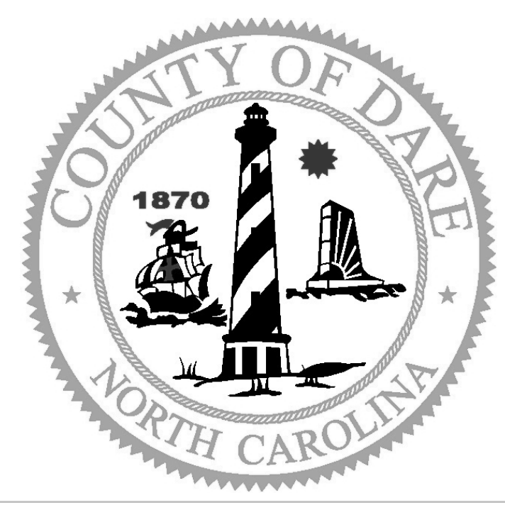
Public Hearing -- Wanchese Minimum Lot Size Amendments