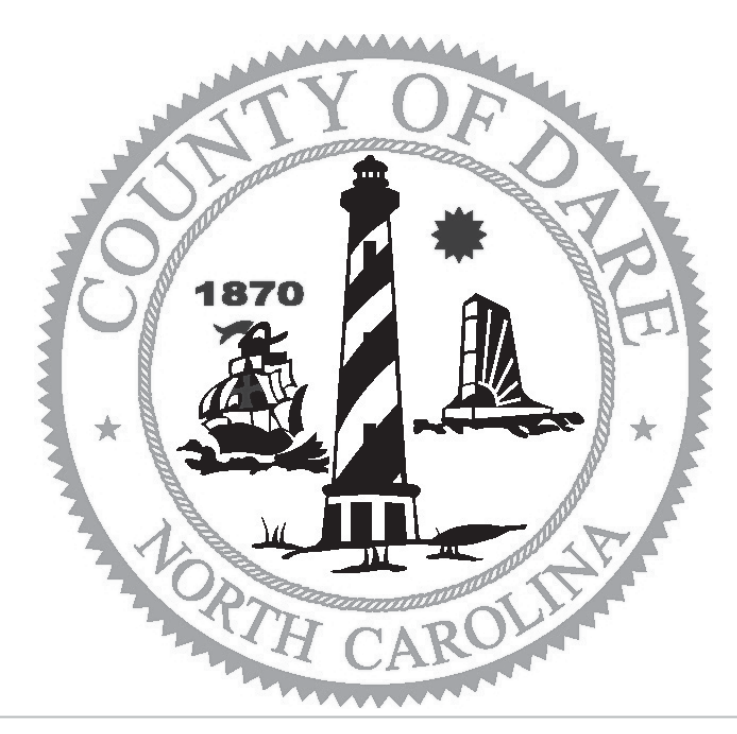
2016 S9 Supplement to Code of Ordinances -Public Hearing