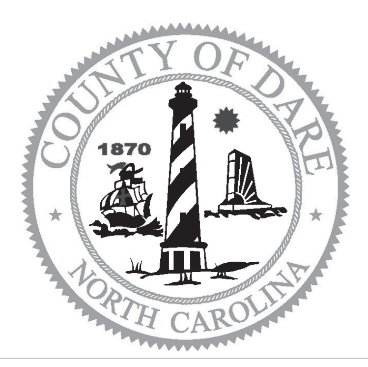
Human Trafficking Awareness Month