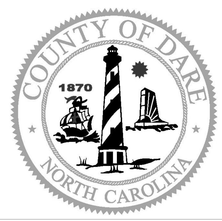
DHHS - Social Services SNAP ARPA Funding Budget Amendment