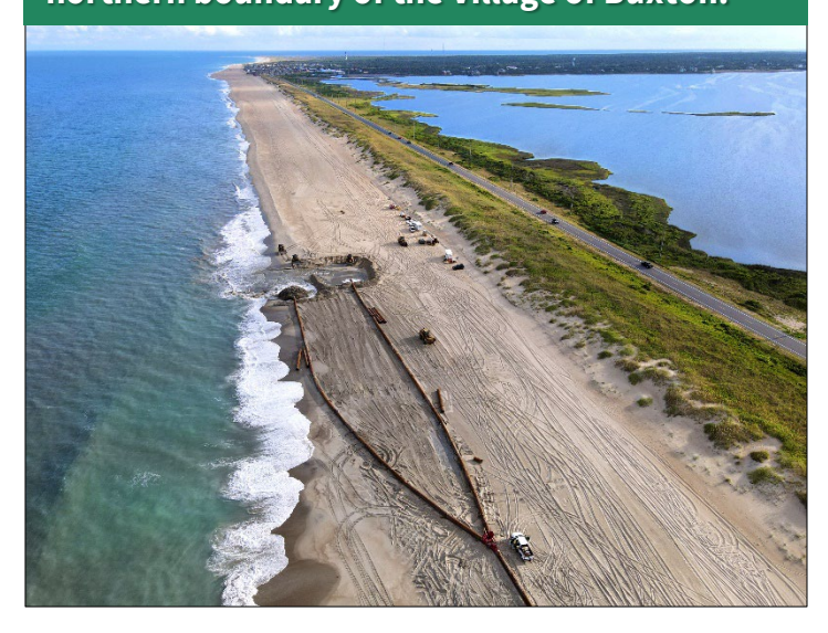
Photo taken Tuesday evening, August 16, 2022, when the Liberty Island delivered her last load at approximately 1.2 miles north of the northern boundary of the Village of Buxton.

After completing the northern section, the dredge Liberty Island started pumping south toward the Village of Buxton to nourish the final section of the project. As GLDD was finishing the last 70,000 cubic yards in the home stretch, mechanical delays occurred on Saturday morning, August 13, 2022, and the dredge had to shut down for repairs. GLDD immediately transported the necessary parts from Texas and scheduled the bull gang for offshore repairs as soon as the parts arrived. The Liberty Island resumed pumping early in the morning on August 15, 2022. By Tuesday evening, August 16, 2022, the dredge delivered her last load, and at that time, GLDD announced that the total project volume (1.2 million cubic yards) had been placed along the 2.9-mile project area.