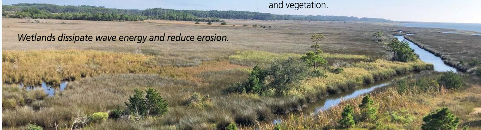
Wetlands dissipate wave energy and reduce erosion.