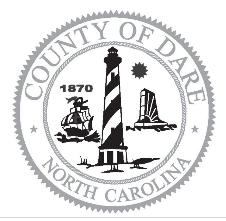
Schedule of Meeting Dates for 2022